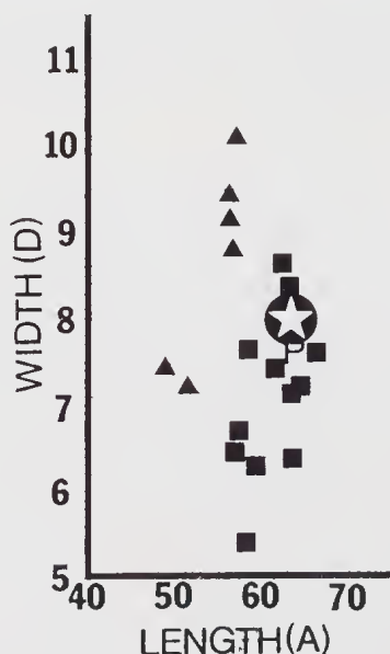
FIG 2. Plot of tibiotarsal proportions of fossil and recent falcons from Australia. For length see Fig. 1; Width = width of shaft at proximal end of supratendinal bridge. See Fig. 1 for legend.

In our sample of ten modern F. berigora (see Pl. 1, Tab. 1, and Figs. 1 & 2), we found sufficient variability in the tibiotarsi to encompass the character-states de Vis believed diagnostic for P. furcillatus : (1) the presence of a distinct, shallow groove between the outer edge of the shaft and the supratendinal bridge (= 'bridge for the extensor tendon') and (2) the greater dilation of the internal border of the shaft distally. A third character that de Vis believed to be 'the most peculiar feature of this tibia' is the Y-shaped nature of the supratendinal bridge producing three distal openings which, however, is actually a diagnostic feature of Falco and most of the rest of the Falconidae.